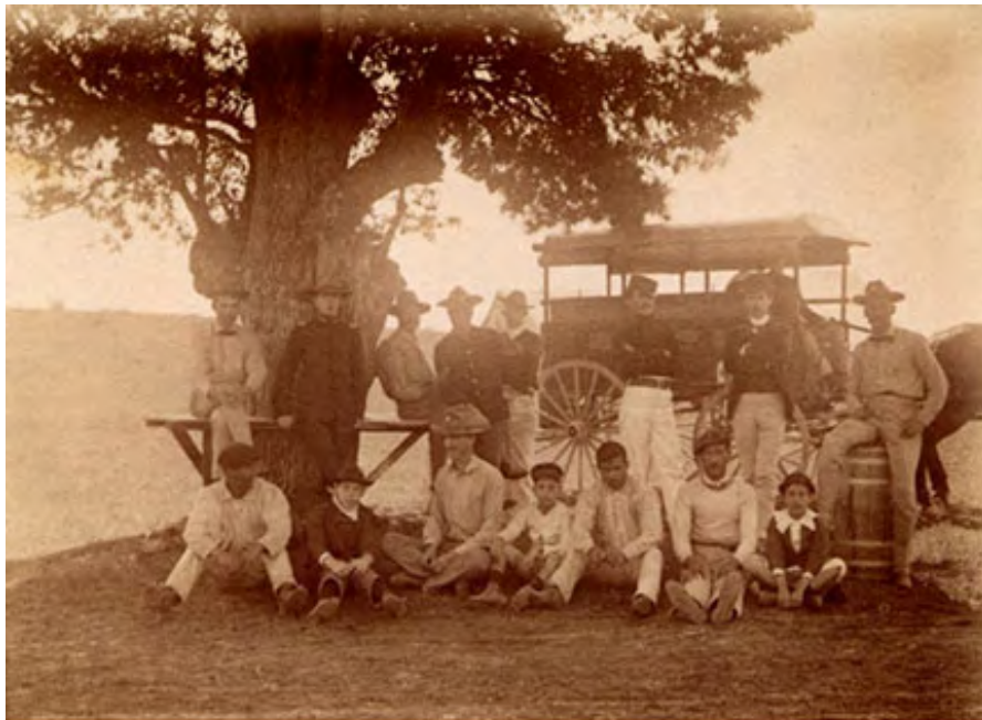
Reed, standing second from right, Volunteers, and others at Camp Lazear, 1901

Yellow fever epidemics frequently broke out in the Caribbean and southern United States, and it especially plagued American soldiers during the Spanish American War. Outbreaks were so prevalent that President Roosevelt asked Army Surgeon General George M. Sternberg to create a commission to study yellow fever in Cuba. He selected Walter Reed and James Carroll as first and second officers in command of the Yellow Fever Commission. Reed and Carroll were highly regarded by Drs. Osler and Welch at Johns Hopkins, who also recommended that Jesse Lazear, the Hopkins clinical laboratory officer, be added to the Commission. Sternberg, Reed and Carroll received research training in William Welch's laboratory at the Johns Hopkins Hospital. Sternberg was the first bacteriologist trained in William Welch's laboratory in the late 1880s before being appointed Army Surgeon General.